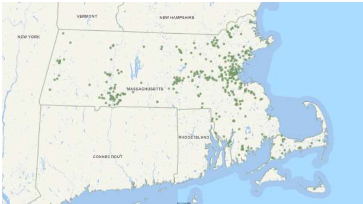
Figure 2 Hospitals and Medical Facilities Included in the Analysis

In addition, there are approximately 490 hospitals and similar facilities in the state. Based on the share of hospital output (a general indicator of overall revenues) attributable to medical imaging, another 3,942 FTE jobs in medical facilities are dependent on the use of this equipment. 6 Figure 2 maps the locations of hospitals and medical facilities used in the study.